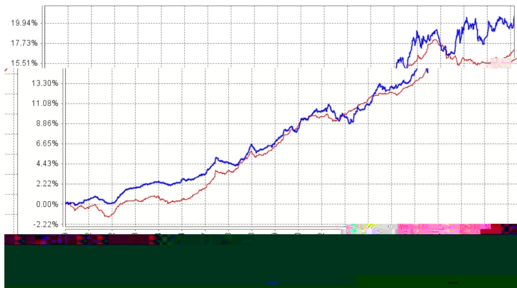
长信利鑫债券 (LOF) A 基金份额累计净值增长率与同期业绩比较基准收益率的历史走势对比图