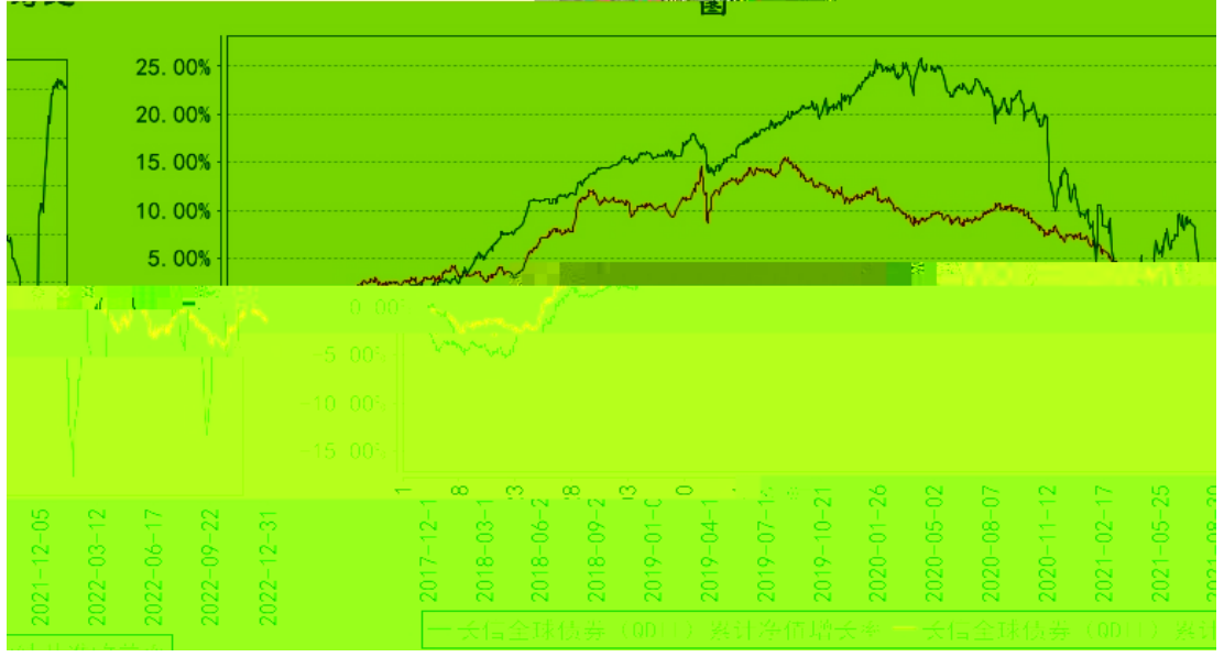
长信全球债券 (QDII) 累计净值增长率与同期业绩比较基准收益率的历史走势对比图